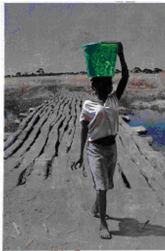
Bridge 192 x 117, oil and inkjet transfer on jute.